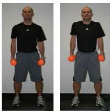
Standing Shoulder Shrugs Stand with feet shoulder width apart. Raise shoulders upward toward ears. Return to starting position.