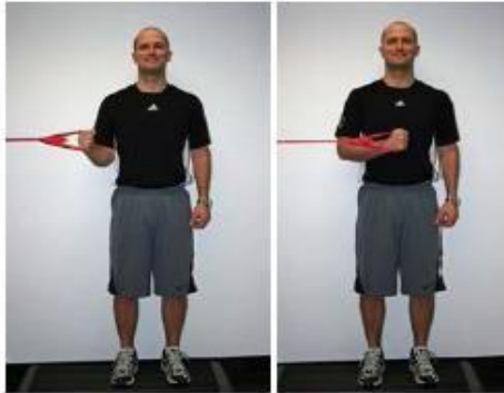
Internal Rotation with Theraband Secure elastic at waist level. Hold elbow at 90 degrees, arm at side. Pull hand across body as shown.