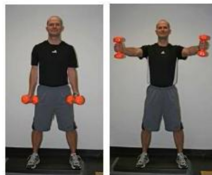
Standing Scaption Hold arm at side, elbow straight, thumb up. Lift arm at 45° angle to shoulder height as shown.