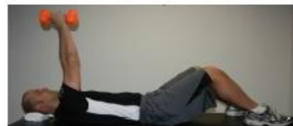
Supine Punch Lie on back, arm straight. Move arm up toward ceiling, keeping elbow straight, lifting shoulder blades off the table.