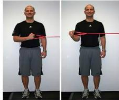
External Rotation with Theraband Secure elastic at waist level. Hold elbow at 90 degrees, arm at side. Pull hand away from body as shown.